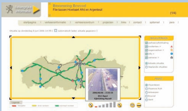
Live camera images on the traffic information map

The camera images can be viewed on the traffic information map by selecting the option "cameras". When moving the cursor over the camera icons, the image pops up.