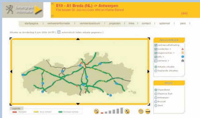
Traffic overview on a map

In June 2004 the «Verkeerscentrum Vlaanderen» launched the website www.verkeerscentrum.be . The real-time traffic overview on the website is automatically distilled from the central database of the «Verkeerscentrum». This database contains information from an array of sources: loops, camera images, information from police services, public servants and other correspondents.