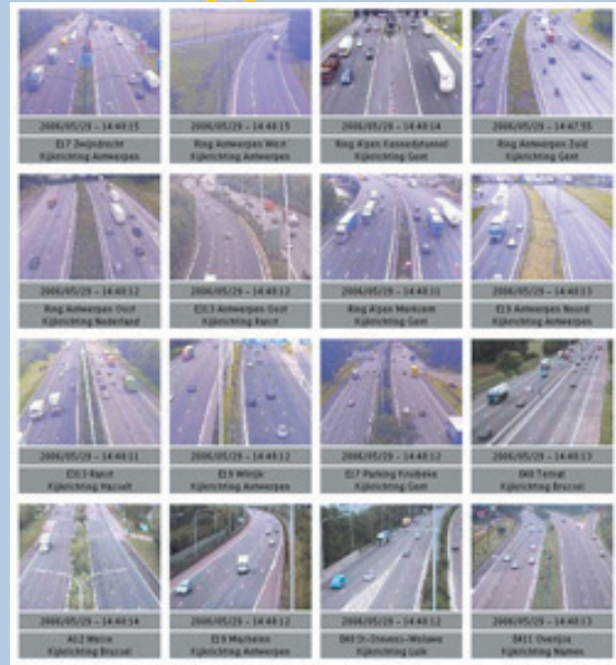
Overview of the live camera images

It is also possible to view all images at once on the overview page.